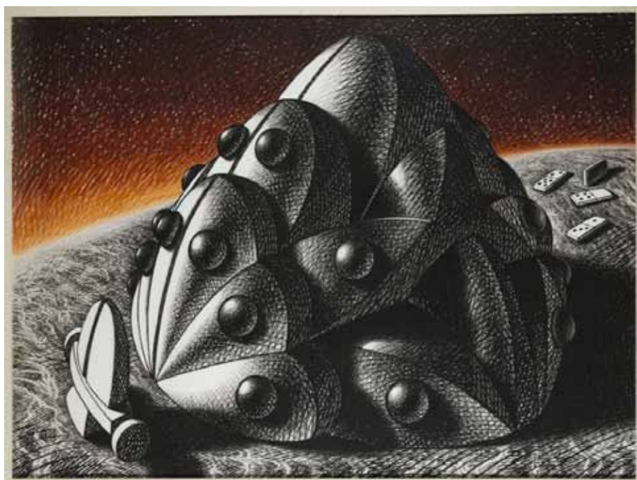
Jose Ramon ALEJANDRO (born in 1943)

Composition, circa 1965 Pastel on paper signed top left 100 x 130 cm € 6 000 / 8 000