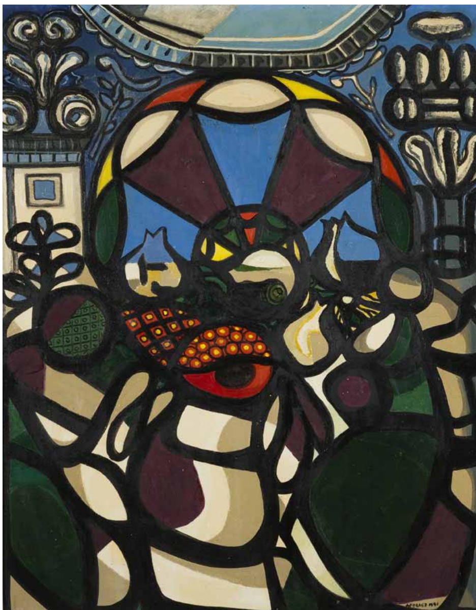
Amelia PELAEZ (1897-1968) Composition (1941) Oil on canvas signed & dated bottom right 109.3 x 86.3cm €150,000 / 200,000